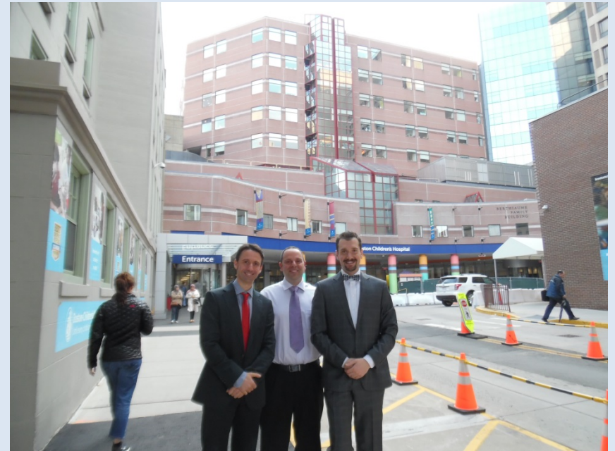
Boston Children's Hospital