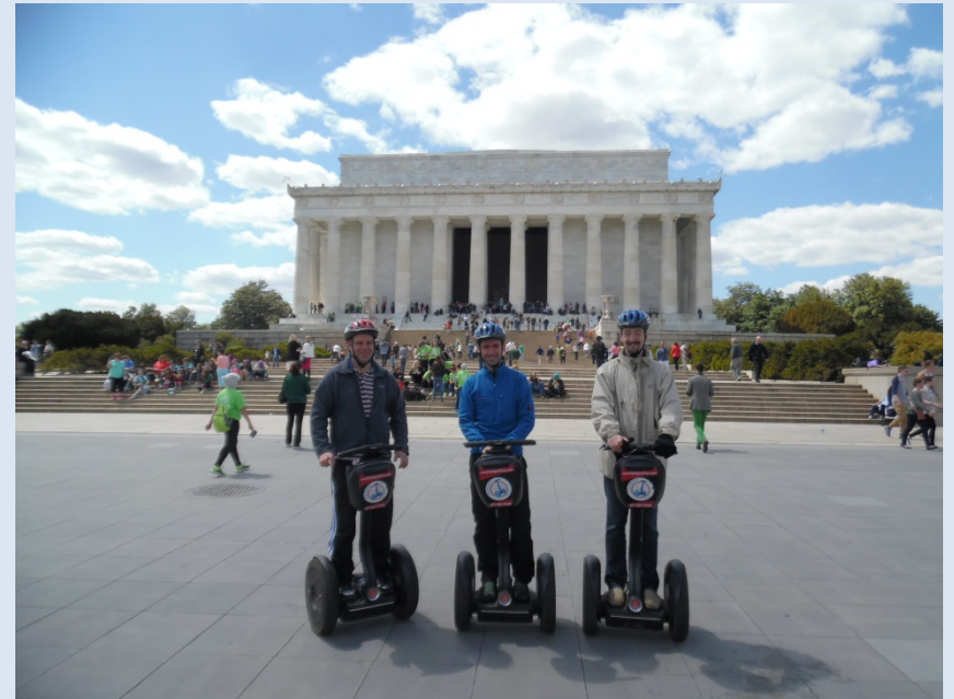
Segway tour of Washington sights