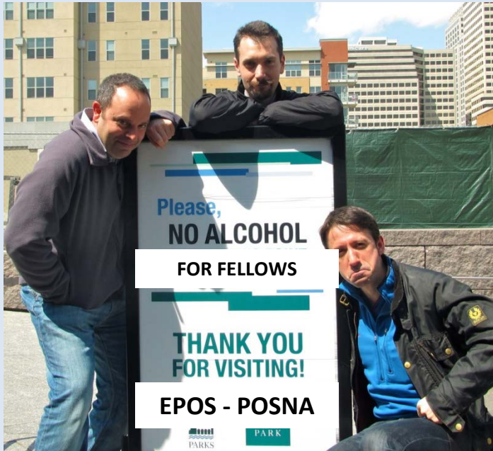
Large Quantities of alcohol....