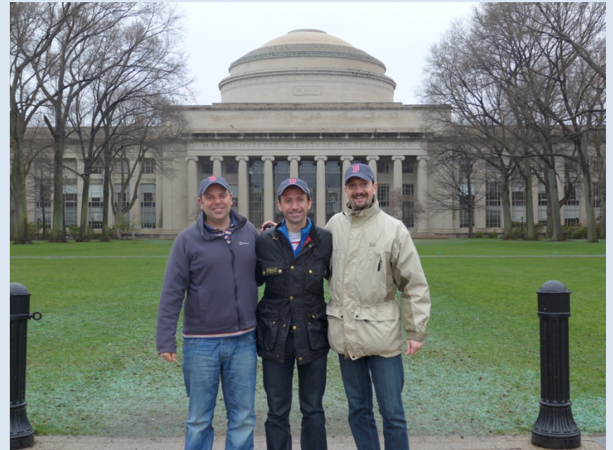
Tour of Boston - MIT