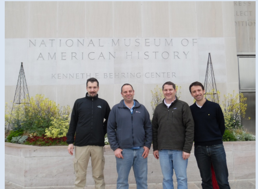
Tour of the capital