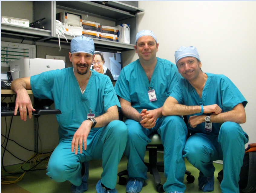
EPOS fellows in theatre