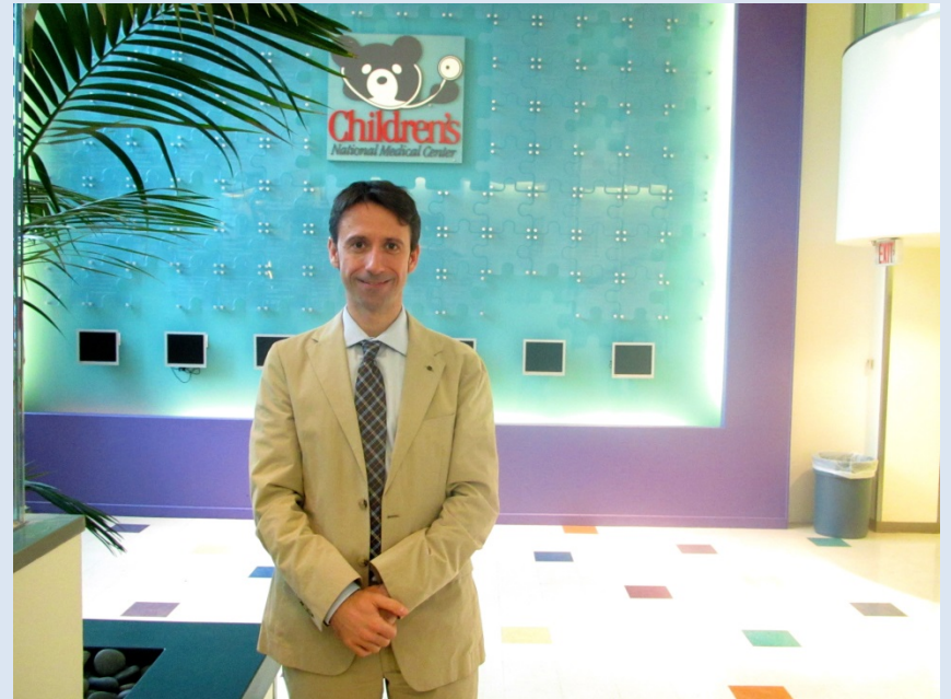
Children's National Hospital