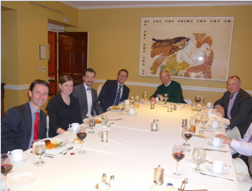
Dinner at the Harvard Club with Boston Children's Faculty