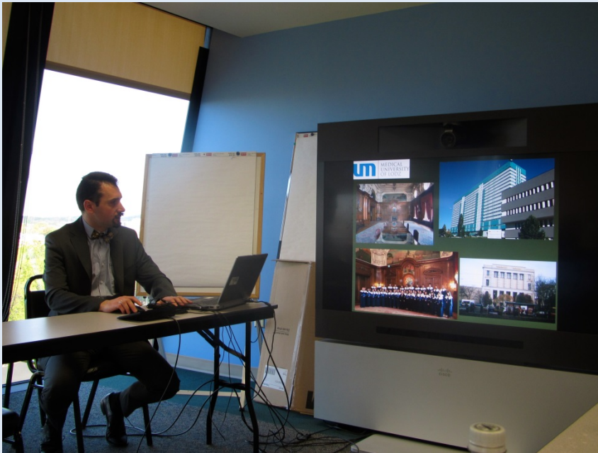
EPOS fellows presenting to Washington Faculty