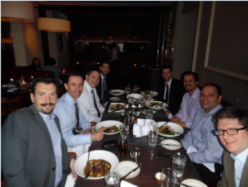
Dinner with the Washington Faculty