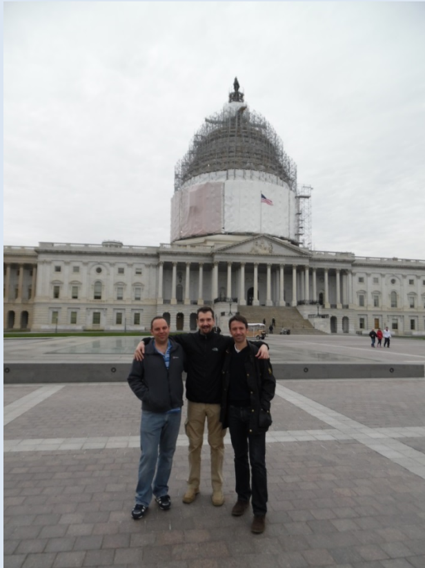
VIP tour of Capitol Hill