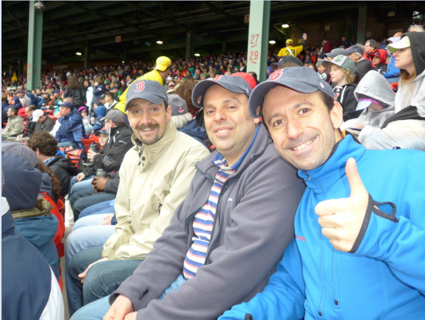
Red Sox game!