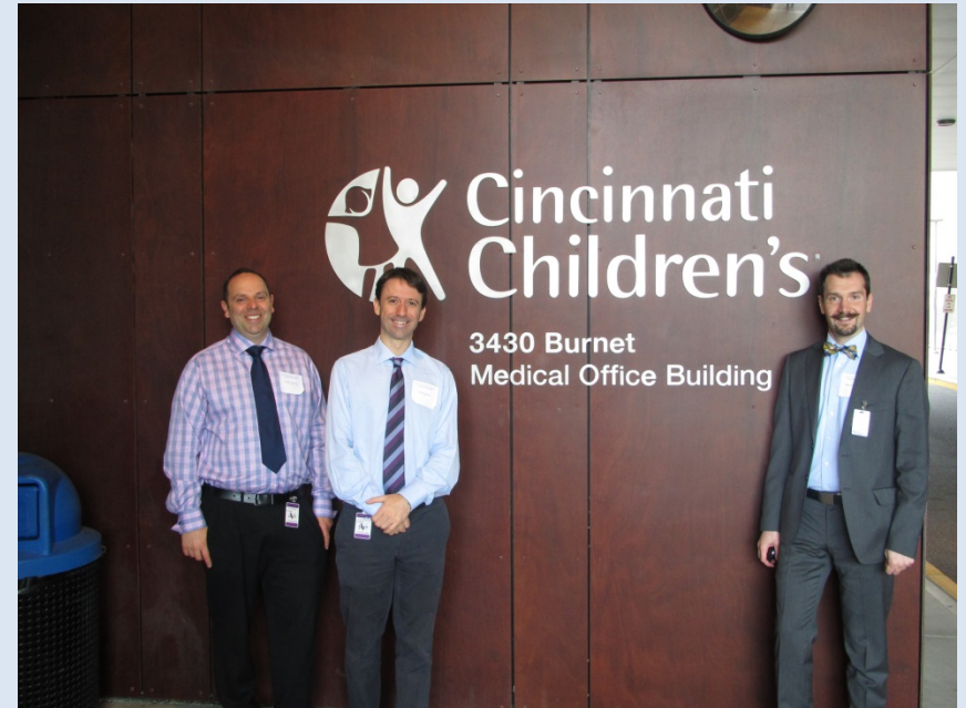
Tour of the hospital