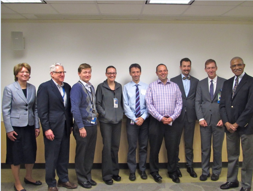
Lectures given by EPOS fellows to Cincinnati team