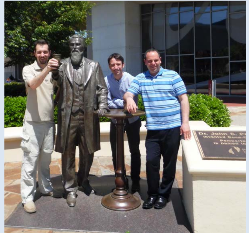
The home of Coca-Cola